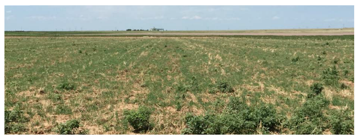
Volunteer wheat and summer weeds during the summer fallow.

There are many risks associated with volunteer wheat. Volunteer wheat can harbor insects and disease pathogens that can be devastating to your upcoming wheat crop in addition to the crop of your neighbor. While it is often believed that volunteer wheat can be a good source of fall pasture, the negative ramifications associated with volunteer wheat far outweigh any potential benefits. In order to minimize potentially significant yield reductions, it is recommended that the volunteer wheat crop be terminated at least two weeks prior to establishment of the next wheat crop in order to break the "green bridge". Once the "green bridge" is broken, populations of insects and disease pathogens may not develop in the new wheat crop.