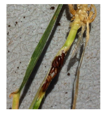
Hessian fly larva pupae.