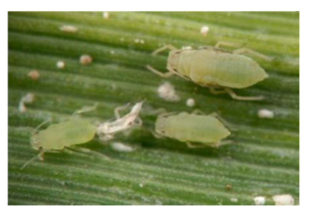
Russian wheat aphids.

into the leaf tissue while feeding. In addition to feeding damage, the aphids are vectors of barley yellow dwarf virus (BYDV) and cereal yellow dwarf virus (CYDV), which cause barley yellow dwarf (BYD). By controlling volunteer wheat and delaying the planting until after October 1, there is less time for aphid populations to become established. In the southern Rolling Plains, Blacklands and South Texas, another major insect pest of wheat is Hessian fly. Managing residue and volunteer wheat are also important strategies for controlling this pest. While the Hessian fly over summers in the larval stage on wheat residue, destruction of volunteer wheat will deprive first-generation adults of places to deposit their eggs.