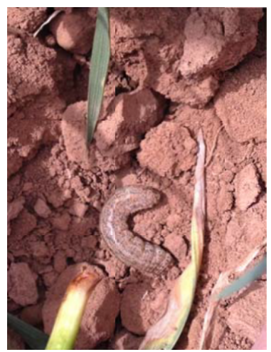
Army cutworm and feeding damage.