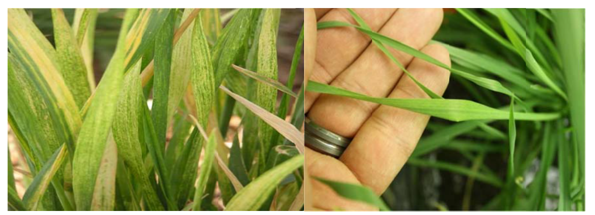
Yellow and mottled leaves from wheat streak mosaic virus (photos courtesy of Jacob A. Price, Charlie M. Rush and Ron. French).

infestation are light green to yellow in comparison to the healthier wheat crop due to the yellow streaking and mottling on the leaf. Further discussion of WSMV and HPV can be accessed at: <a href="http://varietytesting.tamu.edu/wheat/docs/e337wheatstreakmosiacvirus-2.pdf">http://varietytesting.tamu.edu/wheat/docs/e337wheatstreakmosiacvirus-2.pdf</a>. BYDV infected plants are yellow and stunted, and plants often have underdeveloped root systems.