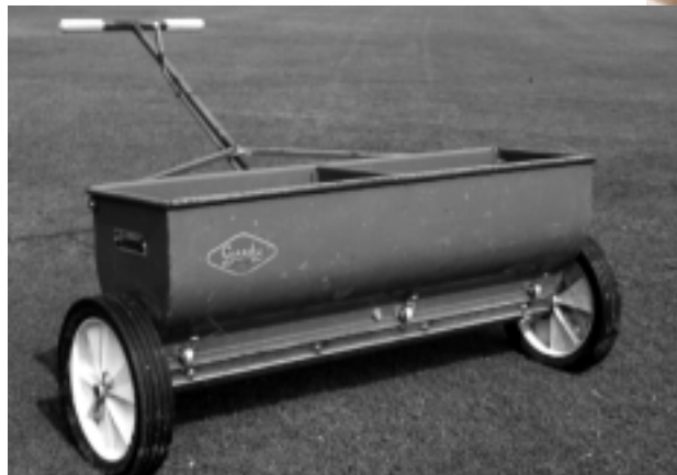
A drop spreader has a uniform, consistent application pattern.

Sweep and weigh method: Push the spreader over a clean, smooth surface of a known distance and sweep and weigh the material. The application rate can be determined by the following.