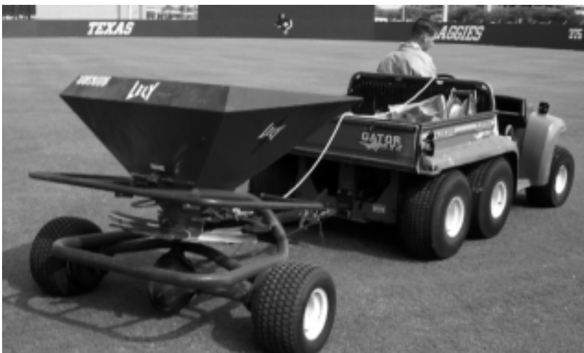
A number of factors affect product distribution.

Make several passes in the same direction over the pans. Make sure the spreader is open before reaching the pans and remember to walk at the speed later used to distribute the material. Collect and weigh the material in each pan on an accurate scale (grams preferred). The data collected will be used to determine the distribution pattern and application rate.