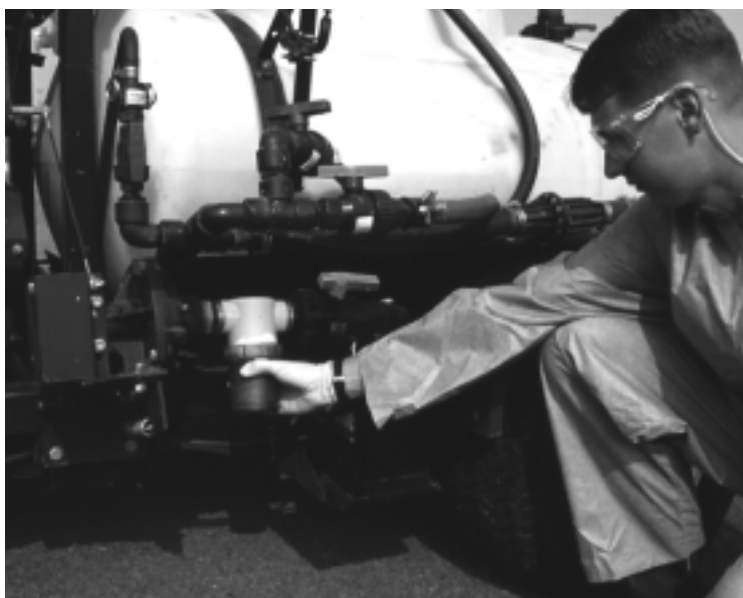
Check and clean filters on the sprayer before use.