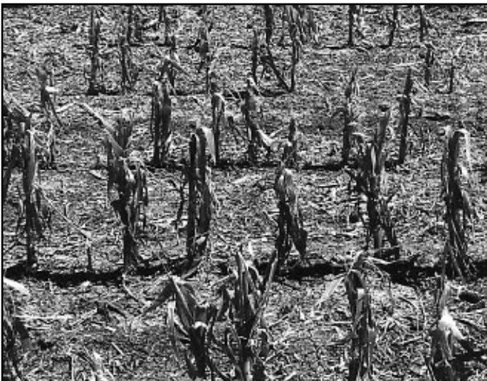
Ragged, hail-damaged corn plants exhibit various degrees and types of damage. Considerable leaf loss may be sustained with minimal loss of yield potential if corn is very young or is almost mature. Shredded leaves become wrapped around the remaining plant and initially restrict the emergence of new growth.

damage sustained. Fields receiving heavy rain are often crusted or compacted from the hail. If you